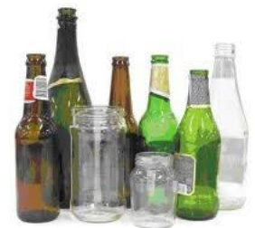
Glass bottles & jars