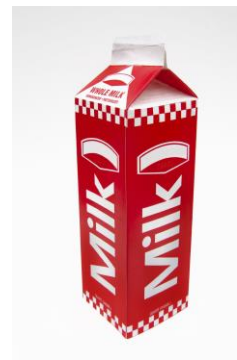
Milk & beverage cartons