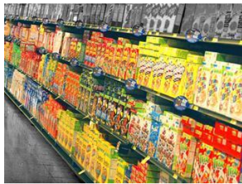
Cereal boxes (no liner)