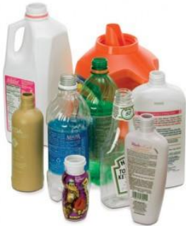
Plastic bottles & jugs