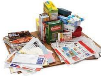
Mixed paper & junk mail