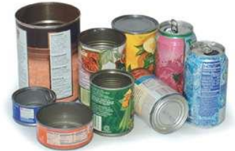
Tin & aluminum cans