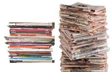
Magazines & newspaper

Other items that are recyclable include: