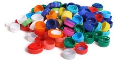
Plastic caps & tops