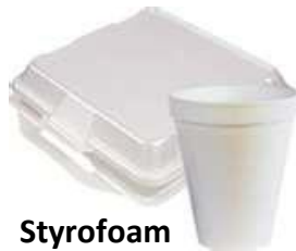
Styrofoam of any kind