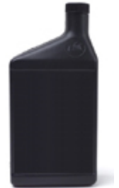
Motor oil & hazardous waste containers