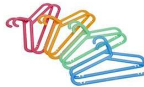
Coat hangers (plastic or metal)