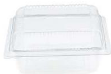
Plastic clamshells and other packaging