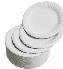
Paper plates, cups & napkins