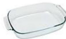
Pyrex & ceramics