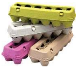
Paper egg cartons