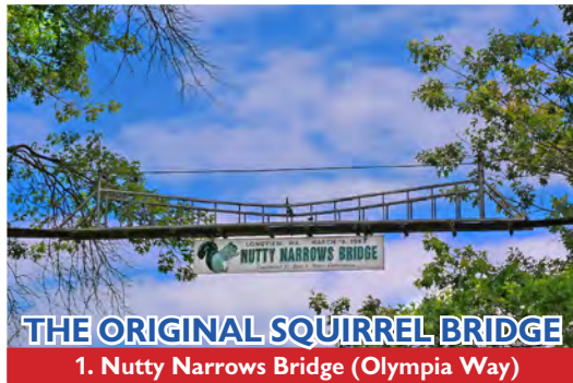
THE ORIGINAL SQUIRREL BRIDGE