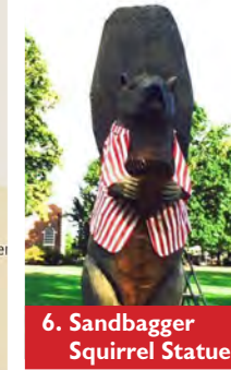
6. Sandbagger Squirrel Statue