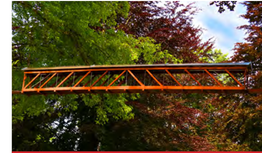
4. OBEC Bridge (Louisiana St)