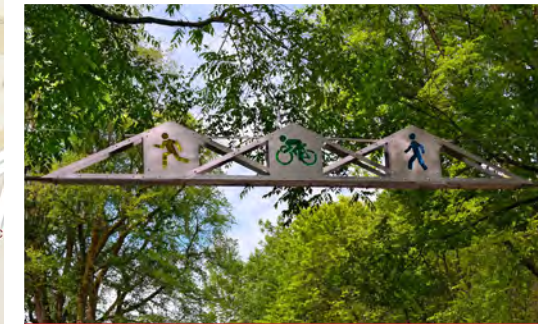
5. Safety Awareness Bridge (1708 Kessler Blvd)