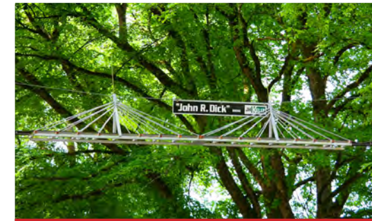
3. John R Dick Squirrel Bridge (Nichols Blvd)